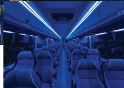
Color LED lighting shown in blue.