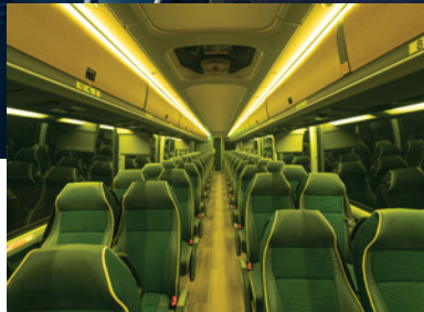
Color LED lighting shown in yellow.