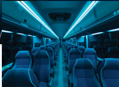
Color LED lighting shown in teal.