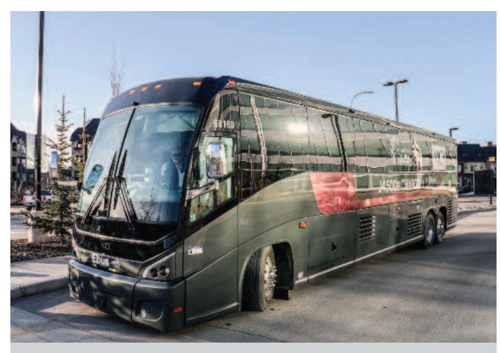
The J4500 CHARGE<sup>TM</sup> provides speeds of up to 72 miles per hour and has a range of 200 miles on a single charge. Other features include regenerative braking to recharge the battery system while braking and the ability to fully recharge the coach in four hours.

providing the benefits that passengers are looking for when they travel: