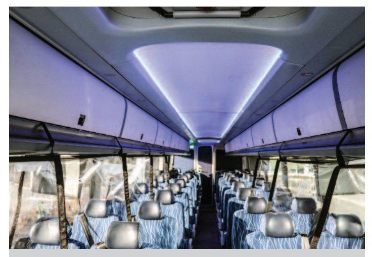
While the componentry of the J4500 CHARGE<sup>TM</sup> is all-electric, the basic body and interior remains typical MCI appearance and quality. The coach seats 56 passengers and provides the same high quality interior and passenger options found on the diesel coaches.