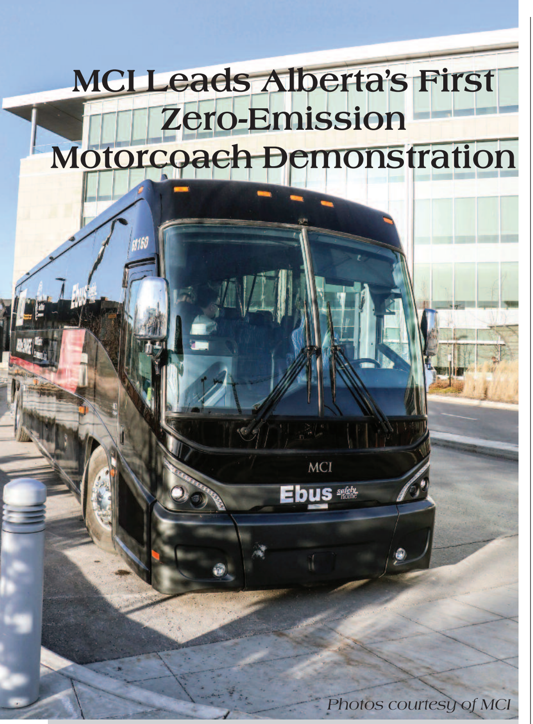
In March MCI and Ebus successfully demonstrated MCI's battery-electric J4500 CHARGE<sup>TM</sup> coach in Alberta. This was the first time that a zero-emission motorcoach was on the road in Alberta. It was also the first time that this coach was used for employee site transportation.

n March, MCI and Ebus (a division of the Pacific Western Group of Companies) successfully demonstrated MCI's battery-electric J4500 CHARGE™ in Alberta. The coach was shown in Calgary and Fort Murray, leveraging zero-emission vehicle technology from New Flyer and delivering range up to 200 miles on a single charge.